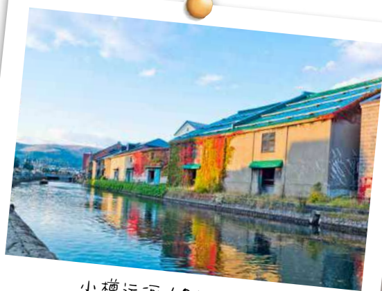
小樽运河 / Otaru Canal