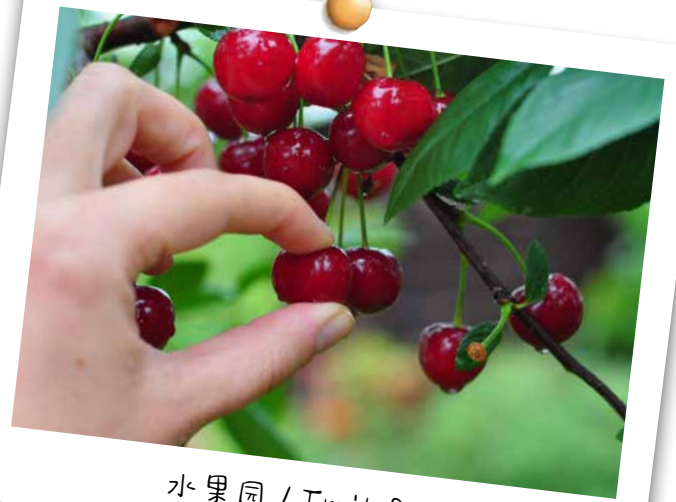
水果园 / Fruit farm

A small town surrounded by picturesque landscapes of gently rolling hills and vast fields. Walk on the undulating hills as if you are walking into a Japanese drama scene.