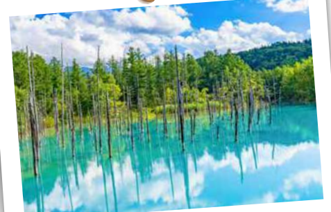
青池 / Blue Pond