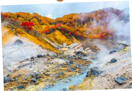
登别地狱谷 / Jigokudani