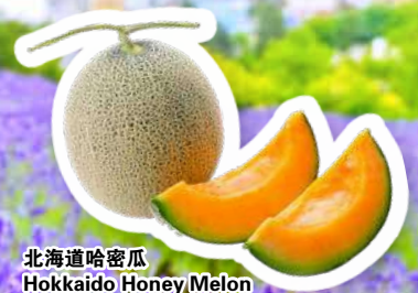
北海道哈密瓜 Hokkaido Honey Melon

※ Sequence of the itinerary is subject to change according to the final flight confirmation.