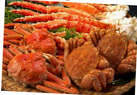
三大北海道螃蟹任吃 / 3 Kind Hokkaido Crab Buffet